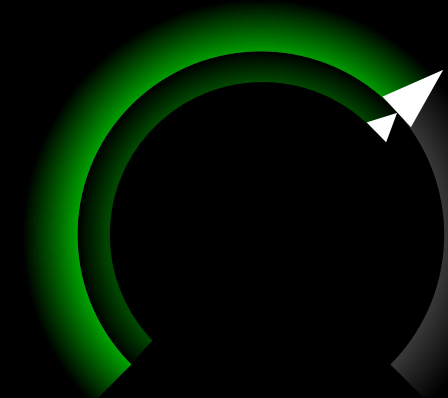
standstill / smooth driving (same position with long-term comp.)

Encourages driver to drive more ecologically ("If You lift your acceleration pedal THIS much, you can drive THIS far!")