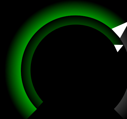
lighter acceleration / braking (shows increased battery range)